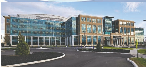
Blue Ribbon for Best Project: Pratt & Whitney Engineering and Technology Center, East Hartford